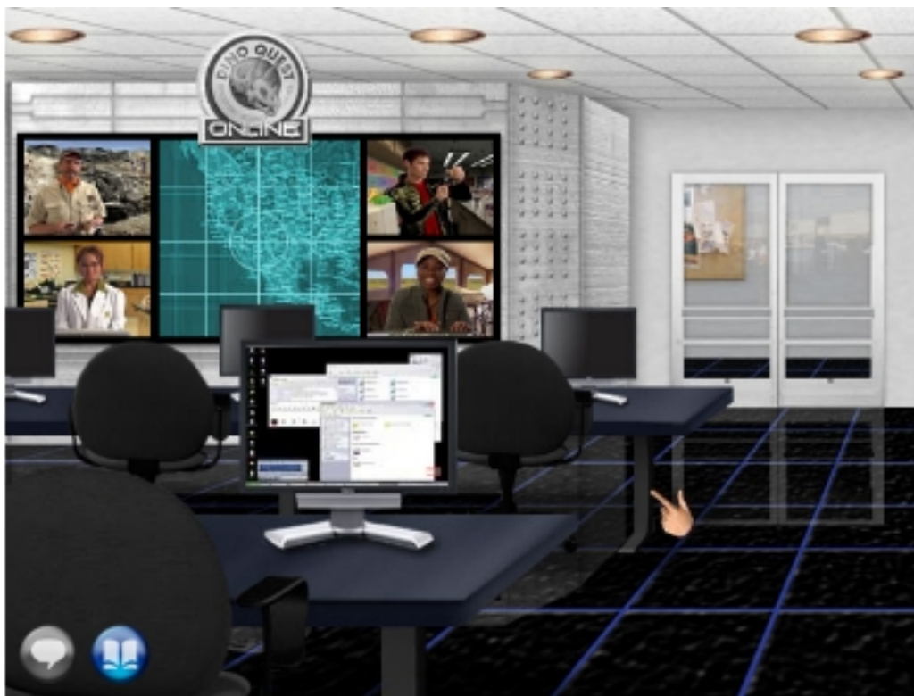
Figure 6. DinoQuest Online in-game home

Multi-genre game design —As previously indicated, DQO consists of 13 game modules. Collectively, they take a player about 3-5 hours to play to completion. However, individual game modules vary in the duration, exposition of life science concepts, and game genre. For example, DQO game modules includes games drawn from quest, design/simulation, puzzle, and mini-game genres. However, it may also be fair to say that these games can individually or collectively be viewed as “casual games” that can be started, played for a brief period, stopped, and restarted later. However, game scores and research points earned persist across game play sessions, as long as the same user (identifier) is