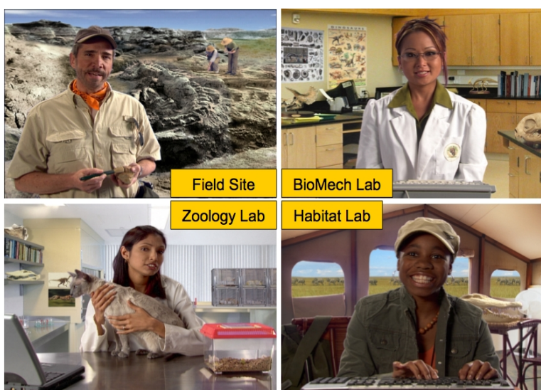
Figure 5. Science role models as DQ collaboratory scientists

Interactive multi-media presentations on demand —Each kiosk contains a networked personal computer that contains a local cache of pre-recorded multi-media content. These recordings depict people acting in the role of different scientists (e.g., paleontologist, zoologist) in different research settings (paleontology field site, research laboratory) who then interact with DQ players to review or explain features/goals of their missions in progress.