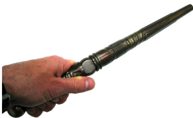
Figure 3. The DQ Infra-Red designator wand, and its use in a DQ discovery mission