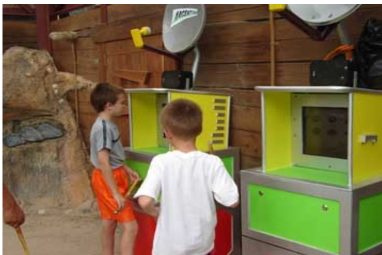
Figure 4. DQ players interacting with kiosks in the field during their current mission

Situated kiosks – Both selection and progress reports associated with each player's current mission can be queried at multi-media kiosks located either in the Field Station or out in the “field.” Both selection and progress reporting are triggered by pointing/gesturing the IR wand in the direction of a kiosk. Kiosks in the field are further assigned as by their association to a virtual collaboratory corresponding to each mission and its geographic location (Africa, Korea, Argentina, United States, etc.). In this regard, we have adopted and integrated the recently developed construct of the research collaboratory [Collabs 2008, Teasley and Wolonsky 2001] into a form that is both (a) accessible to both children, parents, and others in the public, and (b) provides them an introduction, awareness, and simulated experience with such facilities.