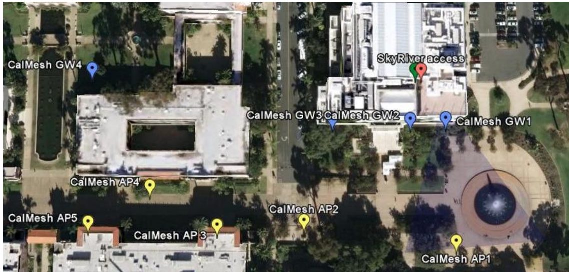
Figure 1. CalMesh deployment in Balboa Park (approximate node locations). The lily pond is where CalMesh GW4 is located (on the left of the photo), the fountain is on the right, surrounded by a circle of wide concrete. The Prado is the area in between.

Measurements: The internet access providers (SkyRiver and HPWREN) stored traffic logs at their respective network operations centers (NOCs) that are available to us. Each CalMesh node stored traffic traces by the use of tcpdump where the IP addresses and type of traffic of each user can be recorded. In addition, each node stored the number of received and sent packets, sampled at programmable time intervals. In addition, some of the access points were open for the general public to study how such traffic impacted the network performance. Signal to noise ratio measurements on the move were made along the node placement route by walking up and down the Prado collecting location-aware data. Monitoring of the aggregated traffic through the backhauls was also performed to give us an idea of total bitrate for event, quality and possibly type of traffic. Data analysis is ongoing.